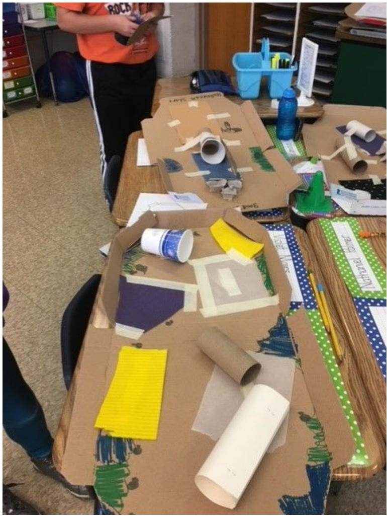
Third grade students created a mini "putt-putt" course using recycled materials.